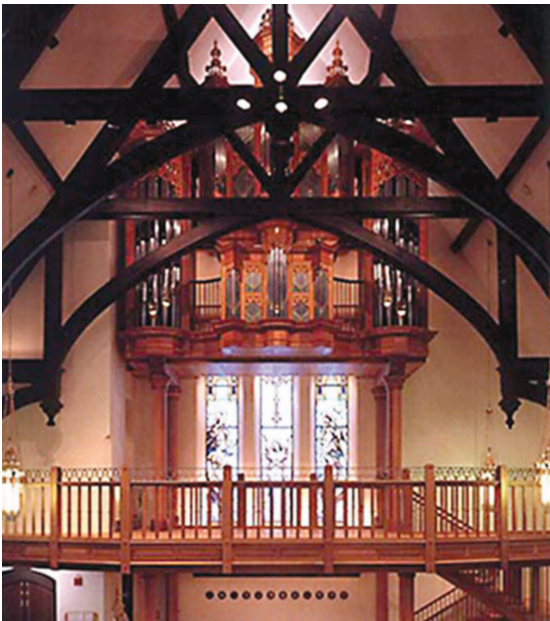
Taylor and Boody, Opus 19, III/P 37 stops, 53 ranks (M) (Christ Church Cathedral, Indianapolis).